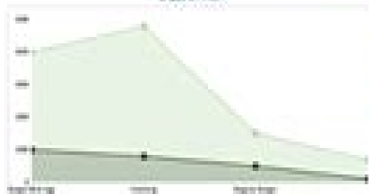
SALES BY ITEM