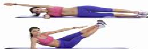
10 SIDE V-UPS (PER SIDE)