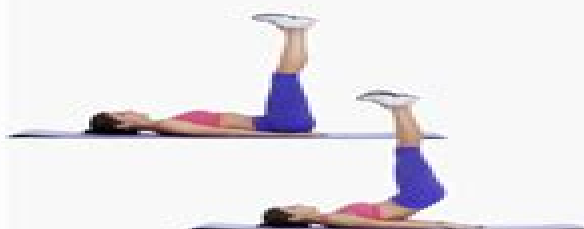
10 LEG LIFTS