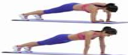
10 DYNAMIC PLANKS