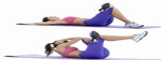
10 KNEE TOUCHES