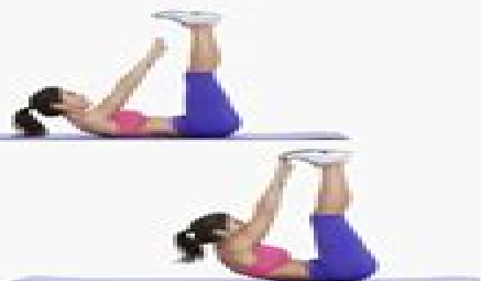
10 TOE TOUCHES