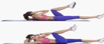
10 BICYCLE CRUNCHES