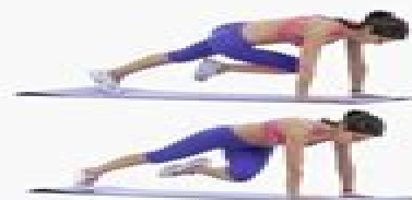
10 MOUNTAIN CLIMBERS