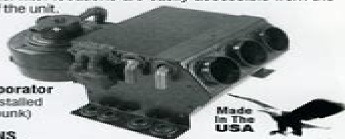
APU Evaporator (To be installed under bunk)

The Frigette System really looks like true "truck equipment" with its step box design. (Footstep is available as an option) Oil, air and fuel filter locations are easily accessible from the top or front of the unit.