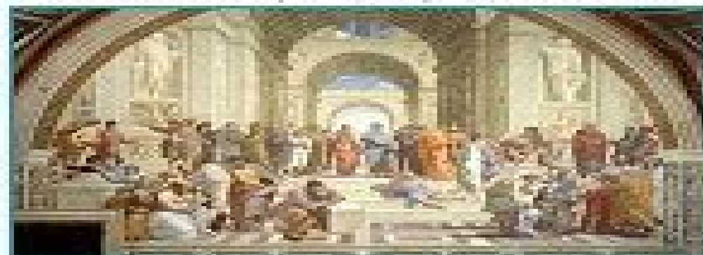
The School of Athens, by Raphael, depicts various philosophers of classical antiquity gathered in one place, with Plato and Aristotle at the center. Raphael modeled Plato after Leonardo da Vinci.

Renaissance artists sought to imitate and surpass the masterpieces of painting. They developed a sense of realism that had not been seen in medieval art by portraying human subjects with realistic proportions. They also employed new techniques, such as linear perspective , which made two-dimensional works of art appear three-dimensional. Renaissance art was heavily influenced by humanistic studies, as evidenced by the prevalence of Greek, Roman, and biblical figures in paintings, sculpture, and architecture.