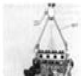
Removing the Outside Head 8-1101