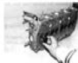
Removing the Side 8-1105