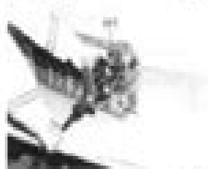
Removing the Side 8-1103