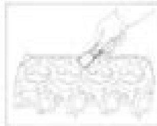
Removing the Outside Head 8-1108