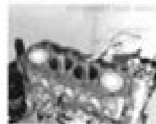
Removing the Side 8-1106

Caution: The side is sharp. Do not touch the side.