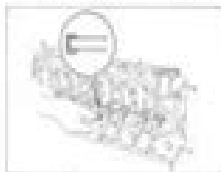
Removing the Head 8-1102