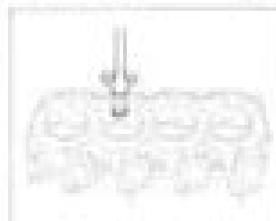
Removing the Outside Head 8-1107