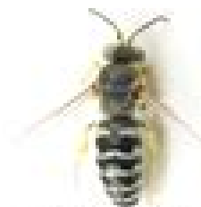
American sand wasp (2.5 to 4 cm) Wave-like banding Bright yellow legs and greyish banding