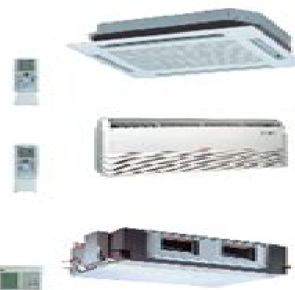
Kanalgerät AD 36 HAHBEA 116 Pa