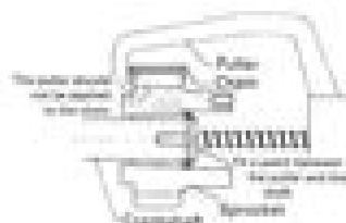
How to fit the puller