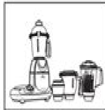
TWISTER (4 Jar)