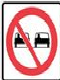
Do not pass