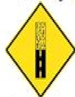
Paved surface ends