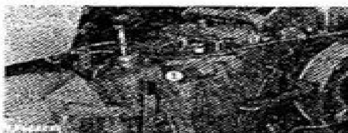
Fig. 4 Left-hand Separation Procedures

Disconnect the clutch return spring. Remove the left-hand and right-hand footrests. Remove the transmission shield.