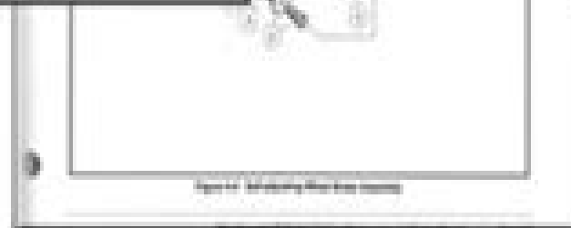
Fig. 1-2. Front view of the chassis