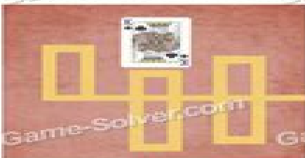
Now You See Me