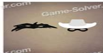
The Lone Ranger