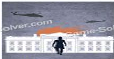
White House Down