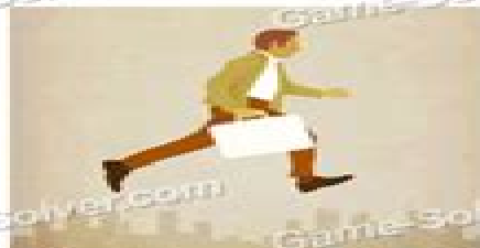
The Secret Life Of Walter Mitty