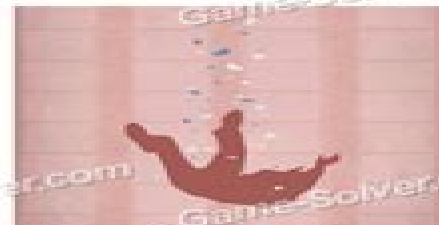
Dead Man Down