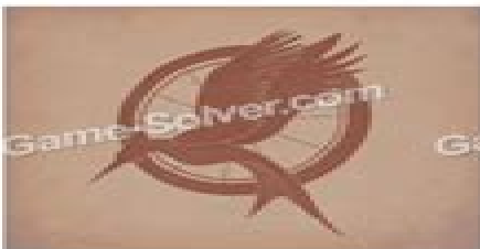
The Hunger Games : Catching Fire