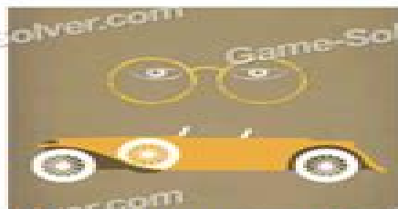
The Great Gatsby