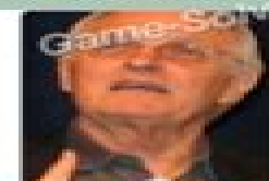
Alan Alda Alan Alda