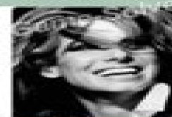
Sandra Bullock Sandra Bullock