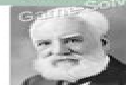
Alexander Graham Bell Alexander Graham Bell