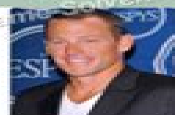
Lance Armstrong Lance Armstrong