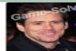
Jim Carrey Jim Carrey