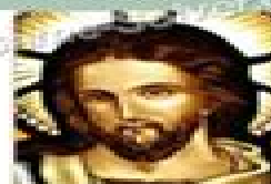
Jesus Christ Jesus Christ