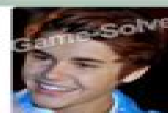
Justin Bieber Justin Bieber