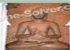
Buddha Quotes Buddha Quotes

by http://game-solver.com/ updated: 2014-04-24 Version 1.0