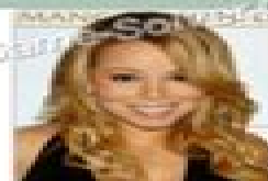
Mariah Carey Mariah Carey