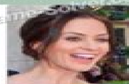
Emily Blunt Emily Blunt