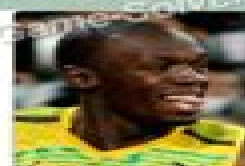
Usain Bolt Usain Bolt