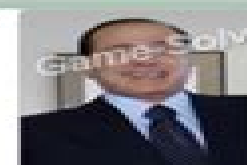
Silvio Berlusconi Silvio Berlusconi