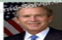
George W. Bush George W. Bush