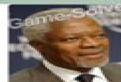
Kofi Annan Kofi Annan