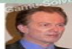
Tony Blair Tony Blair