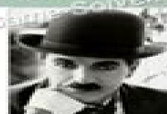
Charlie Chaplin Charlie Chaplin