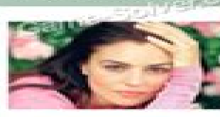
Monica Bellucci Monica Bellucci