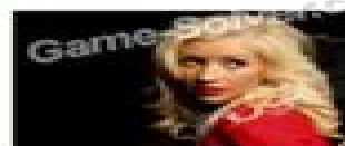
Christina Aguilera Christina Aguilera