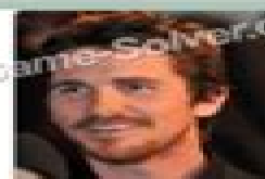
Gareth Bale Gareth Bale