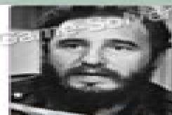
Fidel Castro Fidel Castro