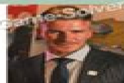
David Beckham David Beckham