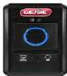
Wireless Wall Console