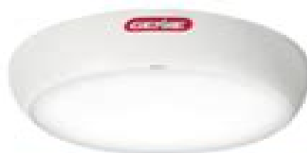
LED Light Fixture