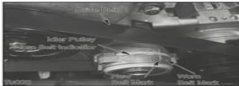
6 Cylinder Drive Belt