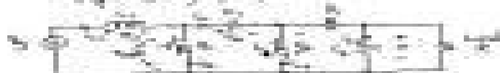
Fig. 2.22, p. 88