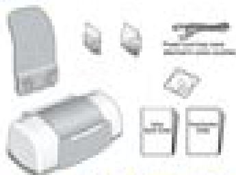
Remember to keep these items handy.