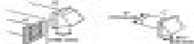
FIG. 1 FRONT VIEW OF DRYER WITH DOOR OPEN

WARNING: TO PREVENT FIRE OR ELECTRICAL SHOCK, DO NOT USE THE DRYER FOR DRYING FLAMMABLE OR EXPLOSIVE MATERIALS.