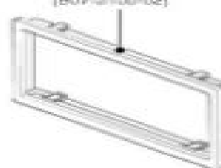
Screw set (N39-1254-05)