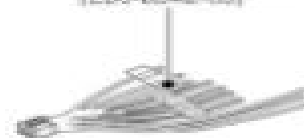
Mounting hardware Assy (J22-0171-03)