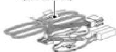
Remote controller Assy (A70-2077-05)