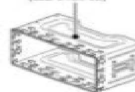
DC cord (DDX6029/6029Y/ 6039) (E30-4531-05)