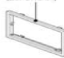
Mounting hardware (J22-0425-03)