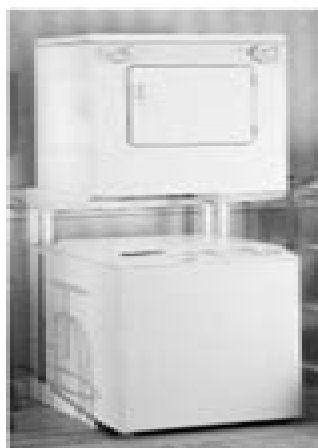
Shown with optional Stack Stand