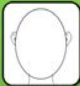
My Grandpa (Dad's dad)