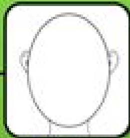
My Grandmo (Dad's mum)