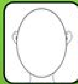
My Grandpa (Mum's dad)