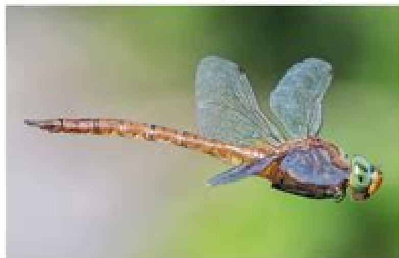
▲ Aeshna isoceles male. Note the contrasting green eyes.