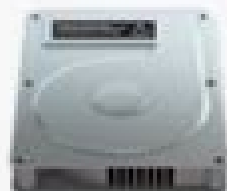
1 TB USB Disk