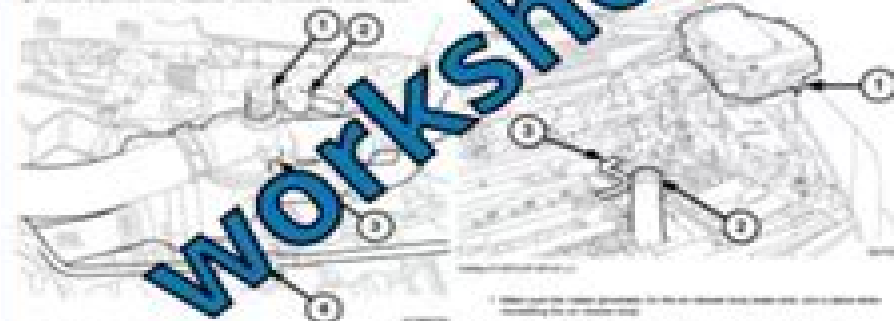
Fig. 2. Water pump pulley, adjuster and locknut