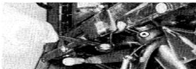
A—Cap Screw (6 used), Washer (10 used) and Nut (4 used)