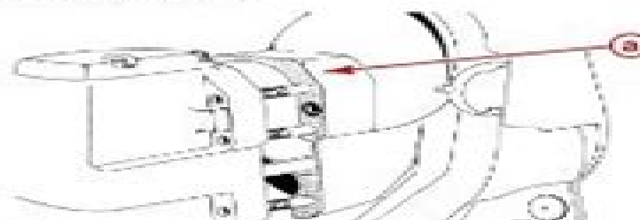
a - Gasket