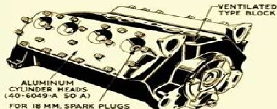
48-6012—(FOR 1935-36 PASSENGER AND COMMERCIAL CARS)