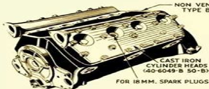
18-6012-D—(FOR 1933, 1934 V-8 TRUCKS)