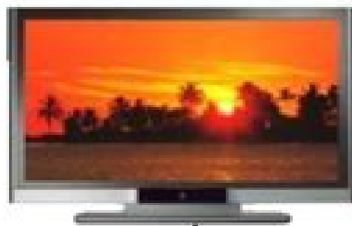
Westinghouse 42w2 42" 1080p LCD