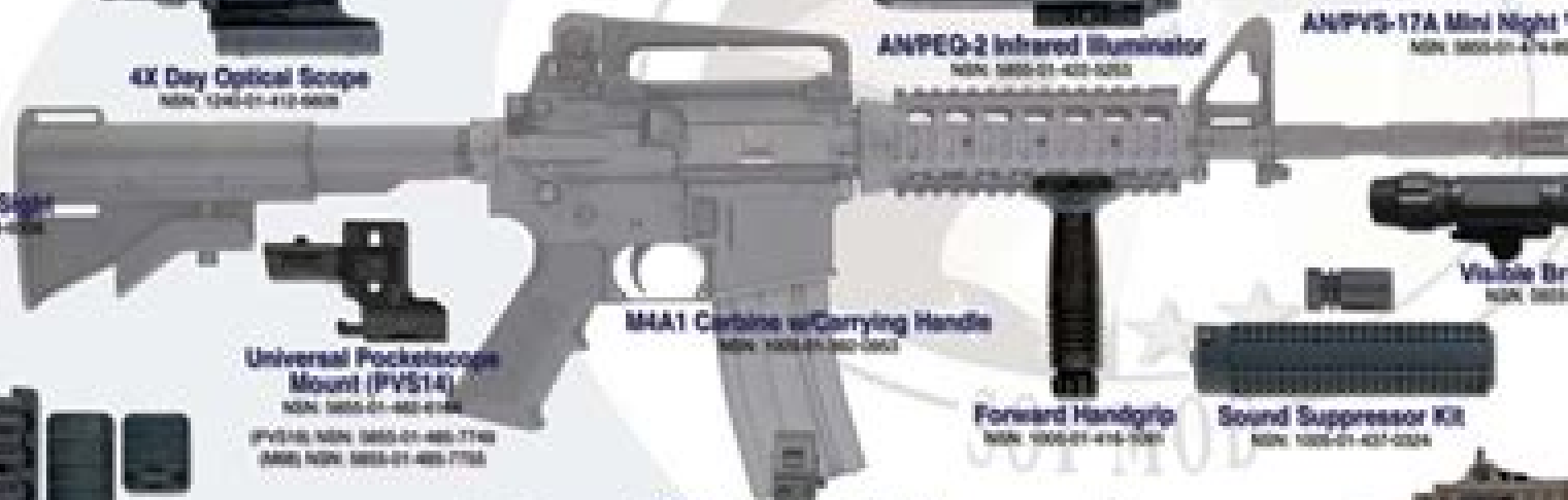
M4A1 Carbine w/Carrying Handle NSN: 1005-01-000-0001