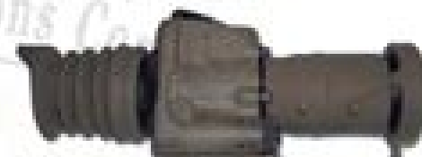
ANPVS-17A Mini Night Vision Sight NSN: 1005-01-414-0004