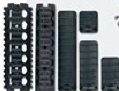
Rail Interface System NSN: 1005-01-410-1088

(PVS14) NSN: 1005-01-400-0146 (AMR) NSN: 1005-01-400-0158