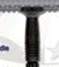
Forward Handgrip NSN: 1005-01-410-1001