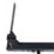
Grenade Launcher Leaf Sight NSN: 1010-01-410-4000