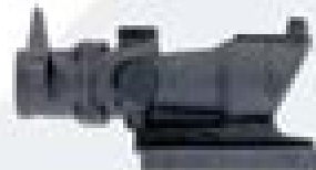
4X Day Optical Scope NSN: 1040-01-410-0008