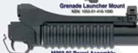
M203 9" Barrel Assembly NSN: 1010-01-410-1400