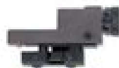
Reflex Sight NSN: 1005-01-400-1096

Cognitive Support: cs@hawaii.army.mil Website: http://hawaii.sopmod.mil