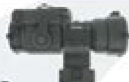
ECOS-N NSN: 1040-01-400-1380