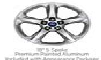
18" 5-Spoke Premium Painted Aluminum Included with Appearance Package