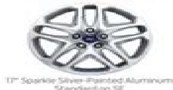
17" Sparkle Silver-Painted Aluminum Standard on SE