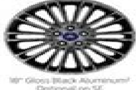
16" Gloss Black Aluminum† Optional on SE