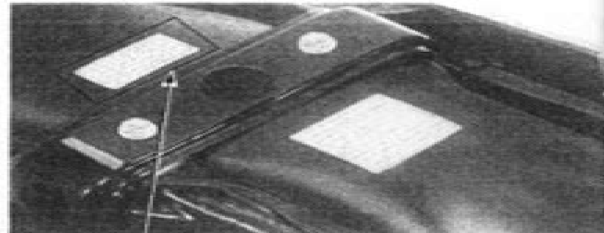
(4) The color label is attached to the rear fender below the seat.