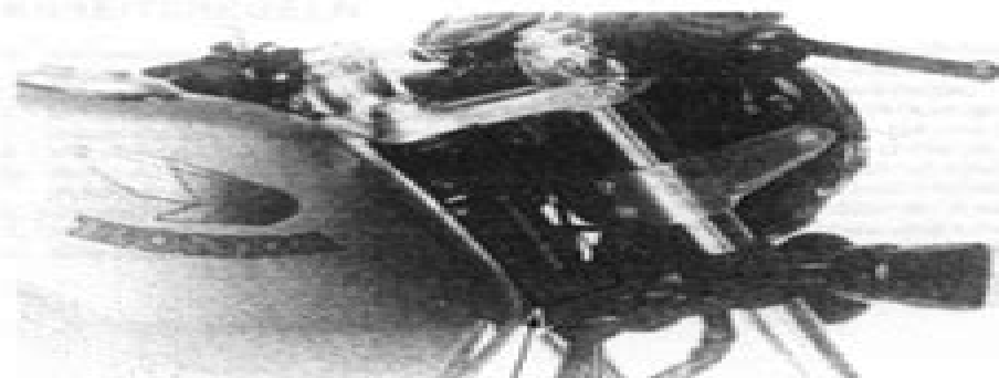
(1) The frame serial number is stamped on the steering head right side.