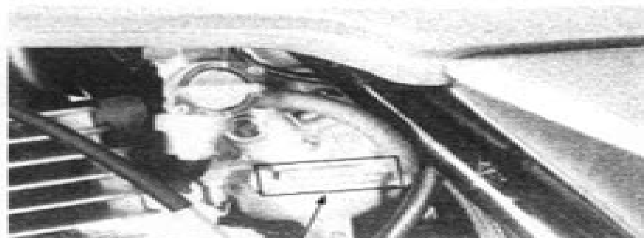
(3) The carburetor identification number is on the left side of the carburetor.