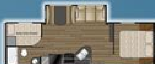
PROWLER LYNX 27 LX