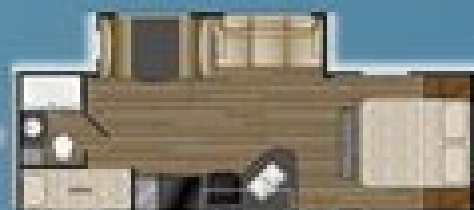
PROWLER LYNX 24S LX