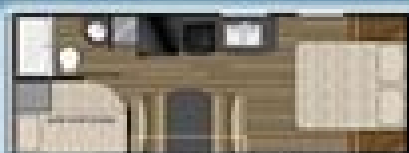
PROWLER LYNX 22 LX