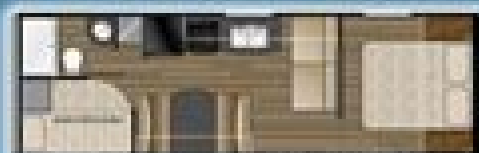
PROWLER LYNX 25 LX