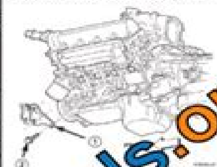
Fig. 47 Engine Insulator Mount Left Vehicle-Left Side 1 - ENGINE INSULATOR MOUNT LEFT SIDE 2 - MOUNTING BOLT