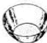
CRUCIBLE, GOOD PORCELAIN