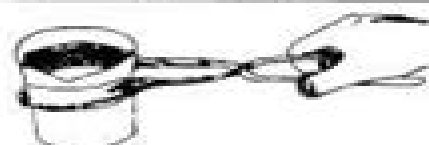
CLAMP, BEAKER, SAFETY TONGS