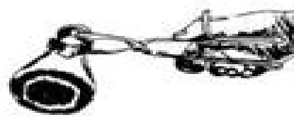
CLAMP, FLASK, SAFETY TONGS