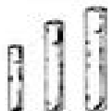
CULTURE TUBE, WITH/OUT STOPPER