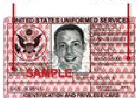
DD Form 1173-1