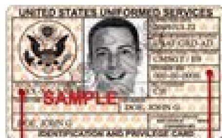
DD Form 1173