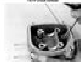
Valve Guide Removal