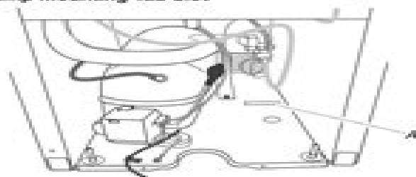
A. Mounting tab slot