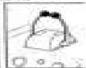
MODEL "30 TRIM"