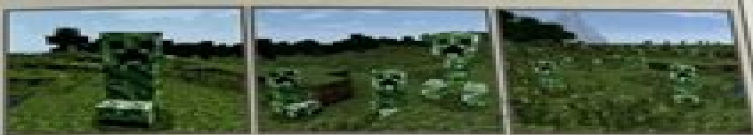
The decision is yours!

In Survival mode you get to have lots of fun fighting off monsters. You can choose to play in different levels of difficulty. If you're a beginner it's best to start off with normal difficulty, but you can also choose easy, hard, or peaceful.