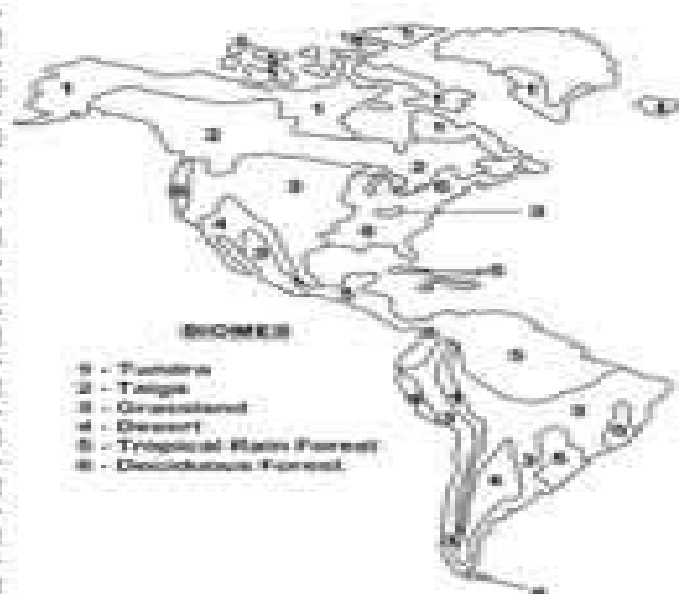
The Earth's 6 Major Biomes

Everywhere you go, you are in a Biome. Scientists have divided our Earth into different regions named biomes. However, not all scientists agree on the number of biomes and we will focus on the six major biomes which are: Deserts, Grasslands, Deciduous Forests, Tropical Rainforests, Taiga, and the Tundra. Each biome has its own unique climate, plant and animal species. Each Biome has its own distinct community of weather, plants and animals who all adapt to their specific biome. Biomes are like ecological communities classified by both living and non living components. The main factors that determine the biome are latitude, altitude, soil, temperature, precipitation, sunlight, plants and animals.