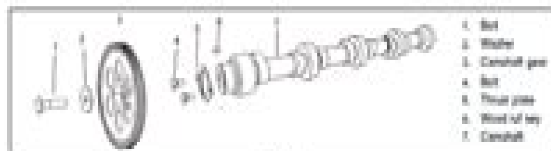
Fig. 4 Crankshaft Assembly

b) Check the fit of the idler gear and shaft to specifications.