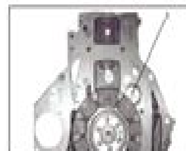
Fig. 7 1. Camry

Lubricate valve tappets and camshaft with engine oil and install into the crankcase.