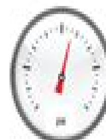
Formation Pore Pressure