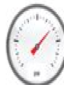
Mud Hydrostatic Pressure