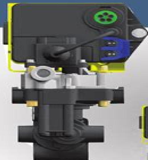
PLC Select 1M -FFABS