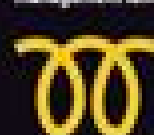
Engine management lamp