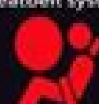
Airbag and seatbelt system