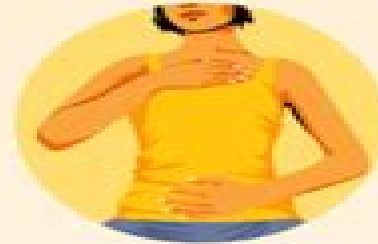
Anxiety relief meditation