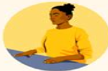
'Do nothing' meditation