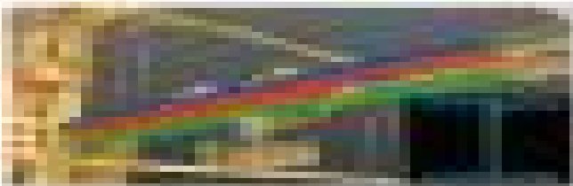
Figure 2: A natural example of light dispersion: a rainbow.

Light is a form of energy that travels in waves. It is made up of particles called photons. The color of light depends on its wavelength. The visible spectrum of light ranges from approximately 400 nm (violet) to 700 nm (red).