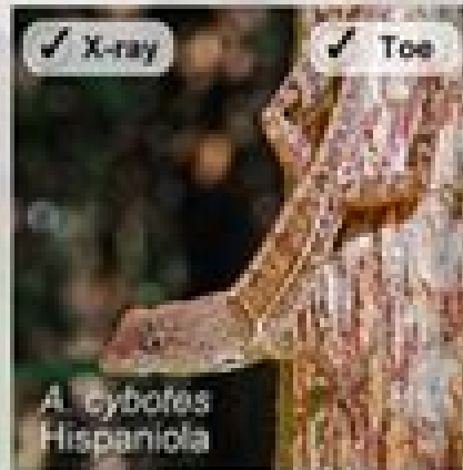
A. cybotes Hispaniola