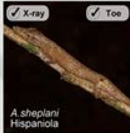
A. sheplani Hispaniola