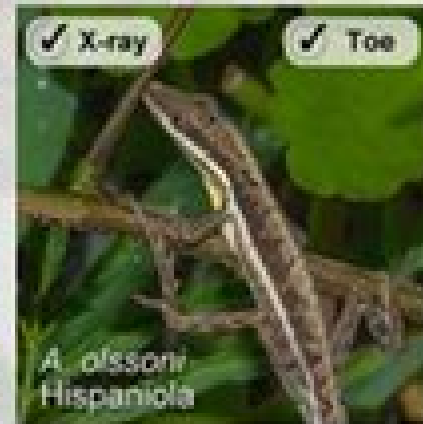
A. olssoni Hispaniola

Press each lizard photo above to measure. You can review how to take measurements by pressing on the "Tutorials" tab.