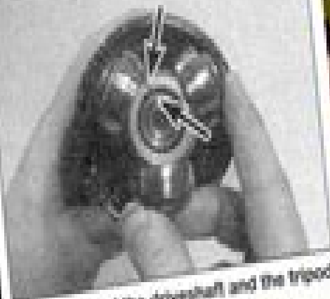
2.5b .... and the driveshaft and the tripod joint